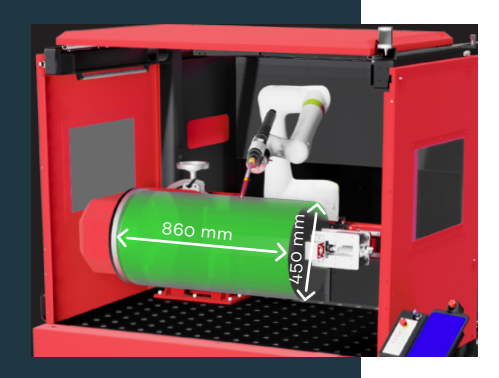
Part dimensions with rotation unit